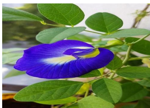
Figure 1: Clitoria ternatea L.

Overall, available scientific evidence supports the significant antimicrobial potential of Clitoria ternatea . The plant exhibits broad-spectrum antibacterial and antifungal activity due to the synergistic action of various phytochemicals. Therefore, Aprajita can be considered a promising natural source for the development of safe and effective herbal antimicrobial formulations and pharmaceutical preparations.